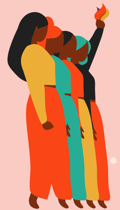
TRANSFORMATIONAL SOCIAL CHANGE